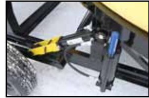
Hydraulic Pump (Fertilizer Tenders)