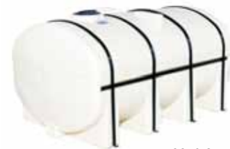
LT3250 Shown with Hoops

* Hoops Required **Stackable ^ In-Stock Item