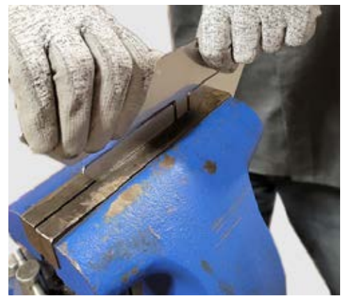
2. Place hands on each side of plate above the seam