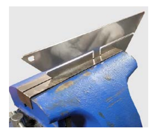
1. Place anti-vortex plate inside vice as shown