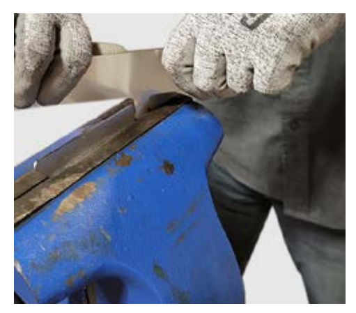
3. Using both hands rotate the top of the plate 90 degrees