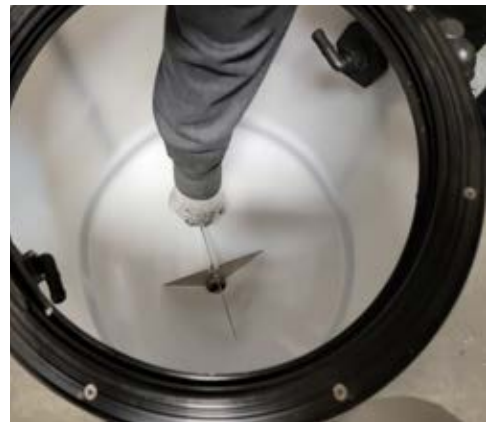
5. Place finished anti-vortex plate inside the tank

Publication: 2022-10-27 www.fsmfg.com 1-800-333-2314